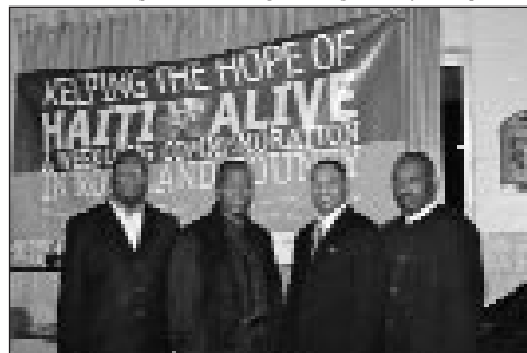
With the help of our fellow Lions from Nanuet, the Mahopac Lions were involved in Rockland County's Haiti Relief Campaign's "Keeping Hope Alive in Haiti Campaign" with a replication of the Tent City in Haiti. This was to commemorate the anniversary of the tragic earthquake that struck Haiti last year and bring attention to the fact that over one million Haitian people are still living in tents.