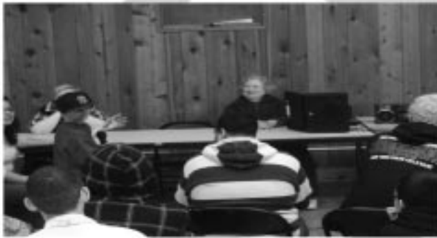
VCB serving youth that are blind with prevocational skills in February 2011

In February during a week long session VCB was able to serve 90 participants. Lions make it possible for VCB to serve children and Adults by: