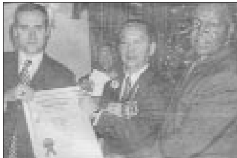
Larchmont Chartered Night last December 10, 2010 sponsored by Phil-Am Lions Club 32 Charter Members