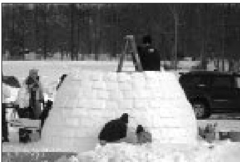
The Blauvelt Lions assisted the Rockland County Tourism at the Ice Fest.