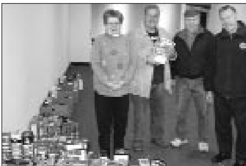
Stony Point Lions Food Drive - Every little bit helps!