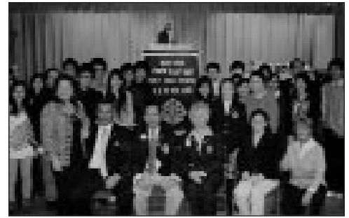
New York Lower East Side Preparatory High School Leo Club sponsored by Cosmopolitan Lions.